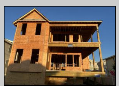
2709-11 West Ocean City, NJ 08226