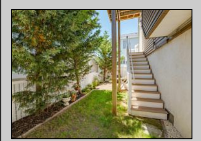
66-68 Sunset Ocean City, NJ 08226