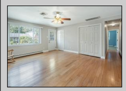
211 Van Sant Linwood, NJ 08221