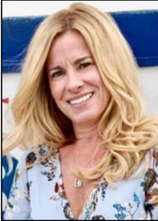
Ceiling Fan(s) Central