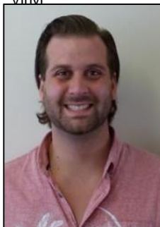
Ceiling Fan(s) Central