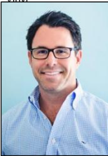
Ceiling Fan(s) Central