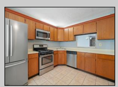
17 Cherokee Dr Galloway Township, NJ 08205