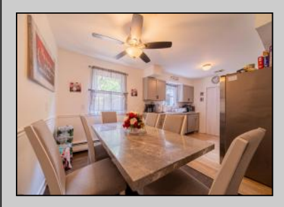
106 Woodcrest Absecon, NJ 08201