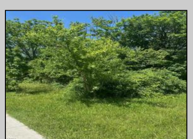
2 Route 50 Tuckahoe, NJ 08270