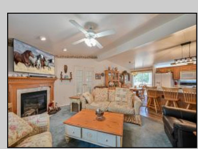
187 Pebble Beach Mays Landing, NJ 08330