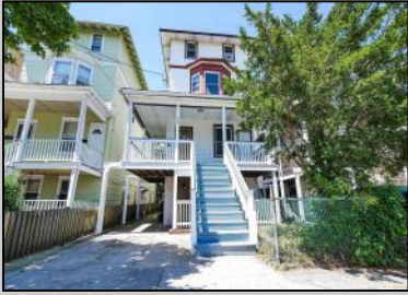
22 Montpelier Atlantic City, NJ 08401