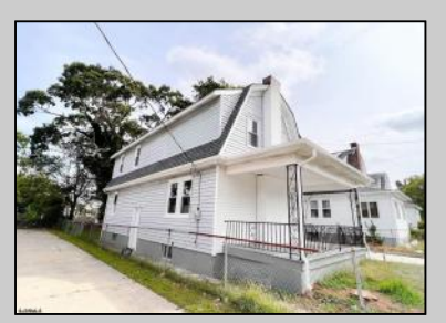
18 Park Ave Pleasantville, NJ 08232