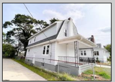
18 Park Ave Pleasantville, NJ 08232