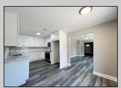
6620 Millville Ave Mays Landing, NJ 08330