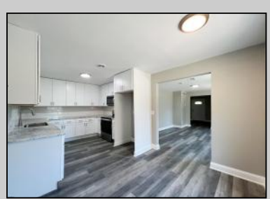
6620 Millville Ave Mays Landing, NJ 08330