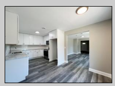
6620 Millville Ave Mays Landing, NJ 08330