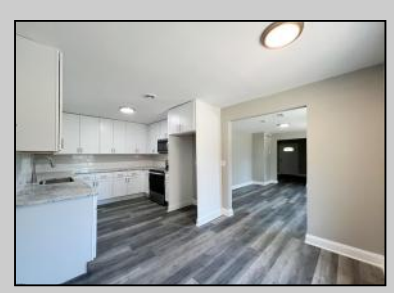
6620 Millville Ave Mays Landing, NJ 08330