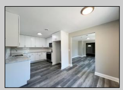
6620 Millville Ave Mays Landing, NJ 08330