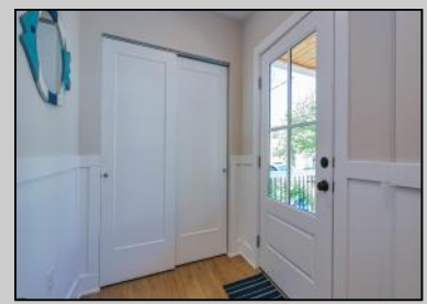
28 Weymouth Ventnor, NJ 08406