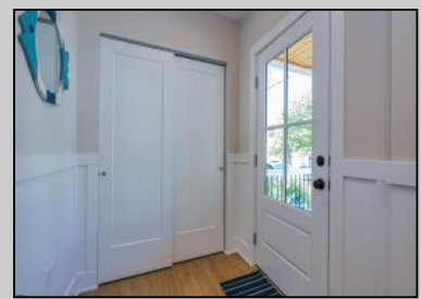
28 Weymouth Ventnor, NJ 08406