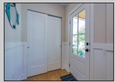
28 Weymouth Ventnor, NJ 08406