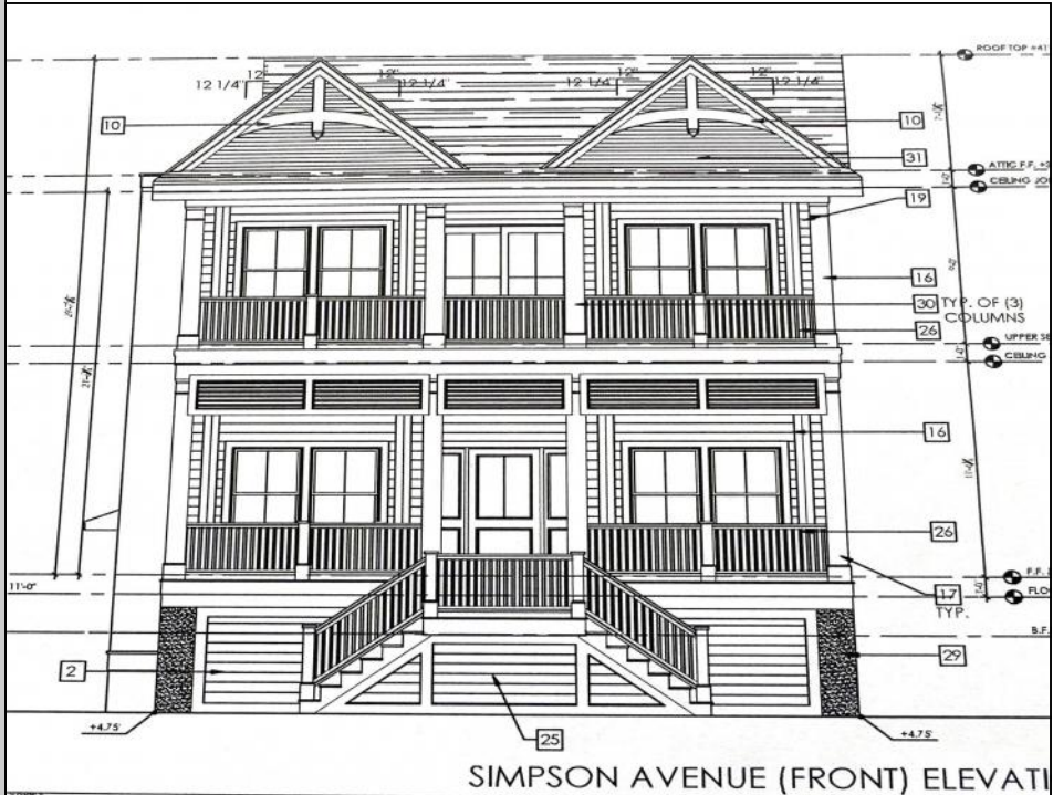
SIMPSON AVENUE (FRONT) ELEVATION