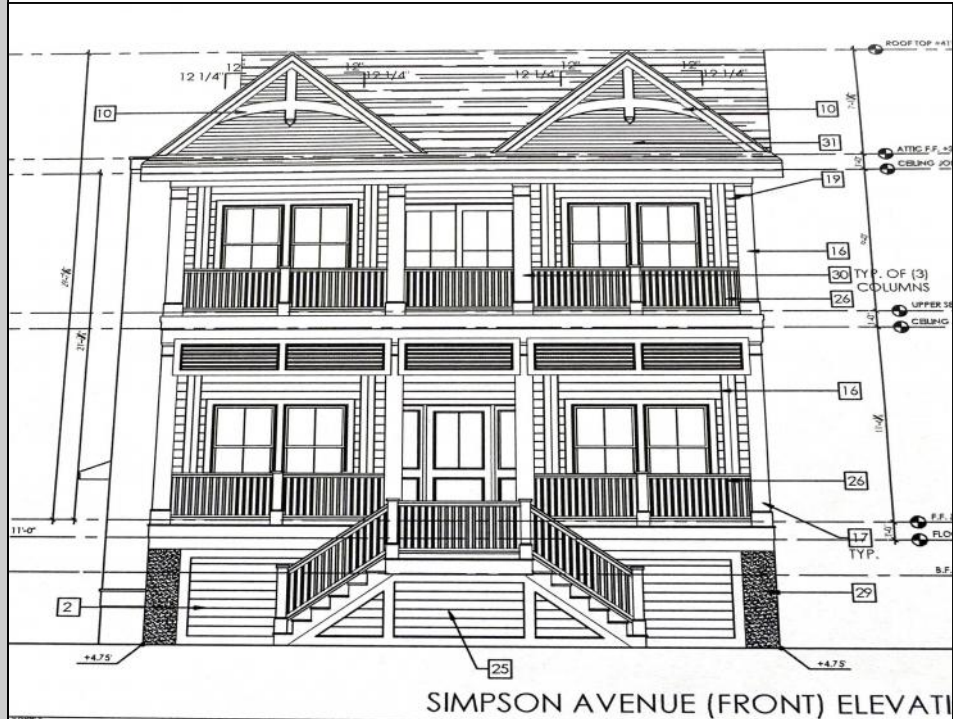
SIMPSON AVENUE (FRONT) ELEVATI