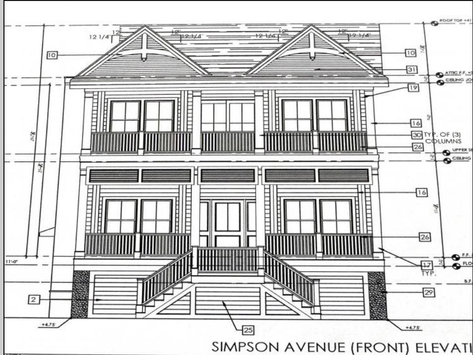
SIMPSON AVENUE (FRONT) ELEVATION