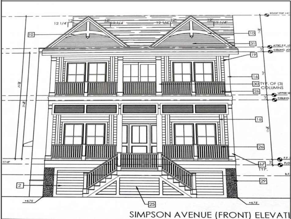
SIMPSON AVENUE (FRONT) ELEVATION