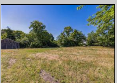
1633 Route 9 Ocean View, NJ 08230