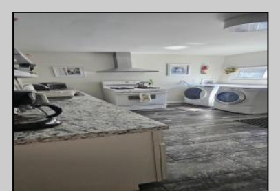
220 New Jersey Atlantic City, NJ 08401