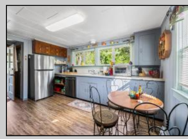
224 Riverside Dr Port Republic, NJ 08241