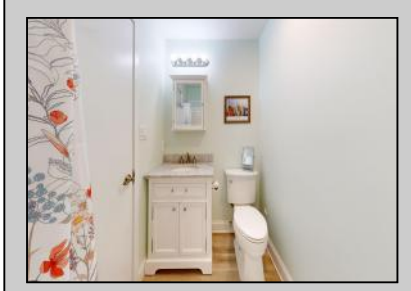
1225 Shore Brigantine, NJ 08203