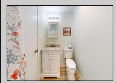
1225 Shore Brigantine, NJ 08203