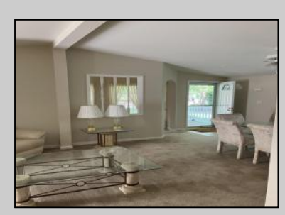
57 Inverness Mays Landing, NJ 08330