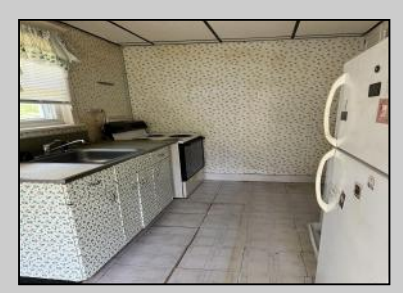
127 Floral Ave Pleasantville, NJ 08232