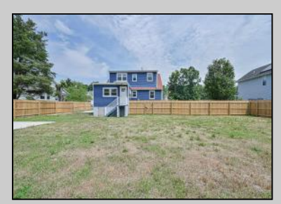
823 Seneca Ave Pleasantville, NJ 08232