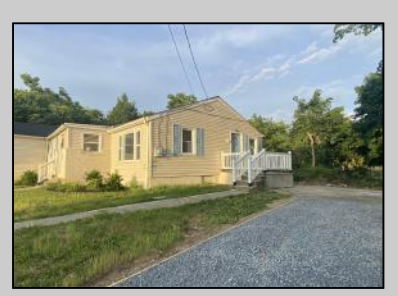
402 2nd Pleasantville, NJ 08232