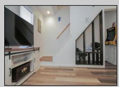
222 New Jersey Atlantic City, NJ 08401