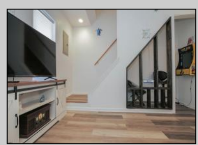
222 New Jersey Atlantic City, NJ 08401