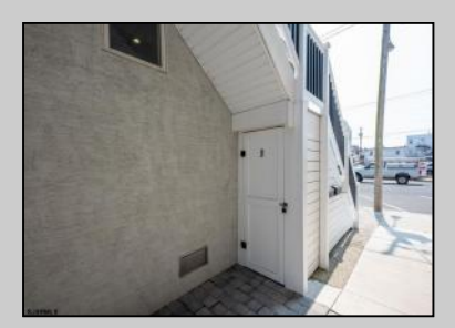
708 West Ave Ocean City, NJ 08226