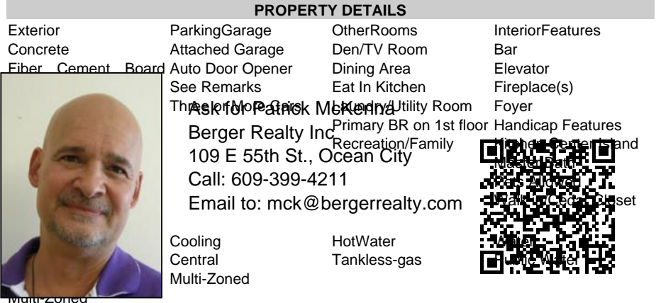
Sewer Public Sewer

LAST TOWNHOME LEFT!! Welcome to Unit 3 at \"Town Walk\", A Luxury Boutique Townhome Retreat. Fabulous Location In the Heart of Margate! ONLY 2 BLOCKS TO THE BEACH!! 3000 Sq Ft SMART HOME with 3 CAR GARAGE and 3 Stop ELEVATOR! Built Like a Fortress with Concrete, Rebar, and Steel Beams. This Townhome Features 5 Big Bedrooms and 4 Full Bathrooms. The Kitchen Features Solid Wood Cabinets, Under Cabinet Lighting, GE Monogram Appliances Complete with a Pot Filler, Quartz Countertops, Under Counter Microwave, and a Large Center Island. The Open Floor Plan, Fireplace, Upgraded Bathrooms, Large Bedrooms, and Generously Sized Closets will Surely Impress! Primary Bedroom Features Tray Ceiling, Private Mahogany Covered Deck, Large Bathroom with Soaking Tub, Oversized Shower, and Backlit Double Vanity. Smart Features Include a Security Alarm, Thermostats, and Speaker System All Operated Remotely from your Smart Phone! Feel the Summer Breeze on Your Large Deck Draped in Mahogany Ceilings....A Perfect Way to Relax and Unwind from a Busy Work Week. Just a Few Steps to Shopping, Restaurants, Nightlife and Mini Golf. Less than a 5 min walk to the beach! $500/month Condo fee Covers Hazard, Fire and Flood Insurance. Pet Friendly! LAST UNIT, CALL NOW!!