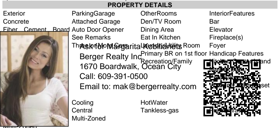
Sewer Public Sewer

Welcome to Unit 3 at \"Town Walk\", A Luxury Boutique Townhome Retreat. Fabulous Location In the Heart of Margate! ONLY 2 BLOCKS TO THE BEACH!! 3000 Sq Ft SMART HOME with 3 CAR GARAGE and 3 Stop ELEVATOR! Built Like a Fortress with Concrete, Rebar, and Steel Beams. This Townhome Features 5 Big Bedrooms and 4 Full Bathrooms. The Kitchen Features Solid Wood Cabinets, Under Cabinet Lighting, GE Monogram Appliances Complete with a Pot Filler, Quartz Countertops, Under Counter Microwave, and a Large Center Island. The Open Floor Plan, Fireplace, Upgraded Bathrooms, Large Bedrooms, and Generously Sized Closets will Surely Impress! Primary Bedroom Features Tray Ceiling, Private Mahogany Covered Deck, Large Bathroom with Soaking Tub, Oversized Shower, and Backlit Double Vanity. Smart Features Include a Security Alarm, Thermostats, and Speaker System All Operated Remotely from your Smart Phone! Feel the Summer Breeze on Your Large Deck Draped in Mahogany Ceilings....A Perfect Way to Relax and Unwind from a Busy Work Week. Just a Few Steps to Shopping, Restaurants, Nightlife and Mini Golf. Less than a 5 min walk to the beach! Condo fee Covers Hazard, Fire and Flood Insurance, Common Area Electric, Common Area Maintenance, Sprinklers, and Trash Removal. Pet Friendly!