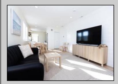
1100 West Ocean City, NJ 08226