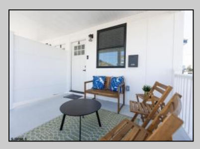
1100 West Ocean City, NJ 08226