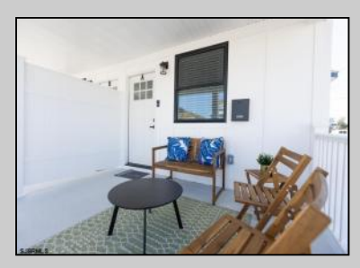
1100 West Ocean City, NJ 08226