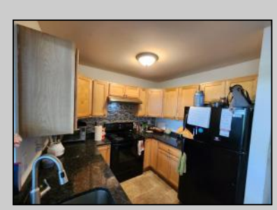
229 Heather Croft Egg Harbor Township, NJ 08234