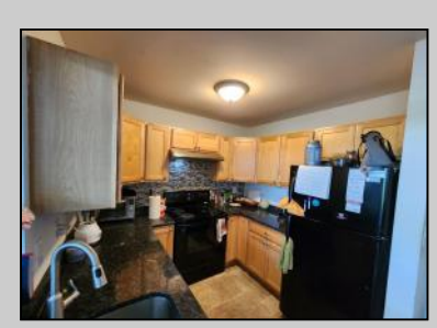
229 Heather Croft Egg Harbor Township, NJ 08234