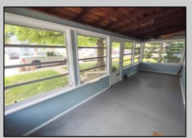
27 Pierson Somers Point, NJ 08244