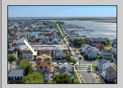
213 Harding Margate, NJ 08402