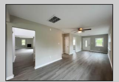
1091 Rt 50 Woodbine Borough, NJ 08270