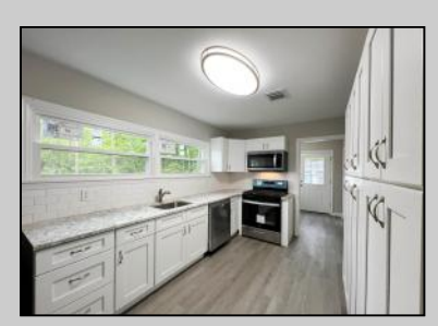
1091 Rt 50 Woodbine Borough, NJ 08270