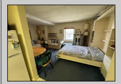
2721 Boardwalk Atlantic City, NJ 08401