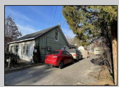
731 White Horse Galloway Township, NJ 08205